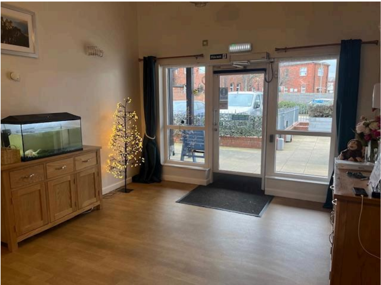
Communal lounge at Lifeways Community Care