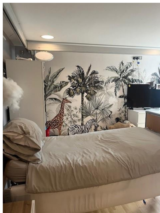
An ensuite bedroom

There is lots to do in the area and residents love going for local walks to parks, the Glass Centre is a short ride away and of course South Shields pier which is always a hit. There are good transport links which enable access to all of the local amenities.