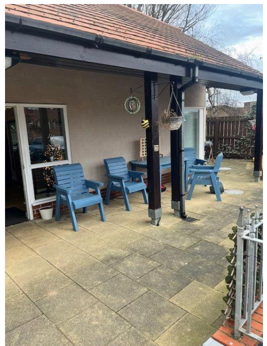
Outdoor recreation space

Find out more about the Enter and View process here: