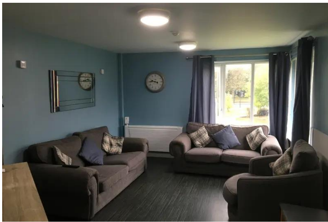
A lounge at Dean View Villas

The visit to Dean View Villas was carried out on December 3, 2025.