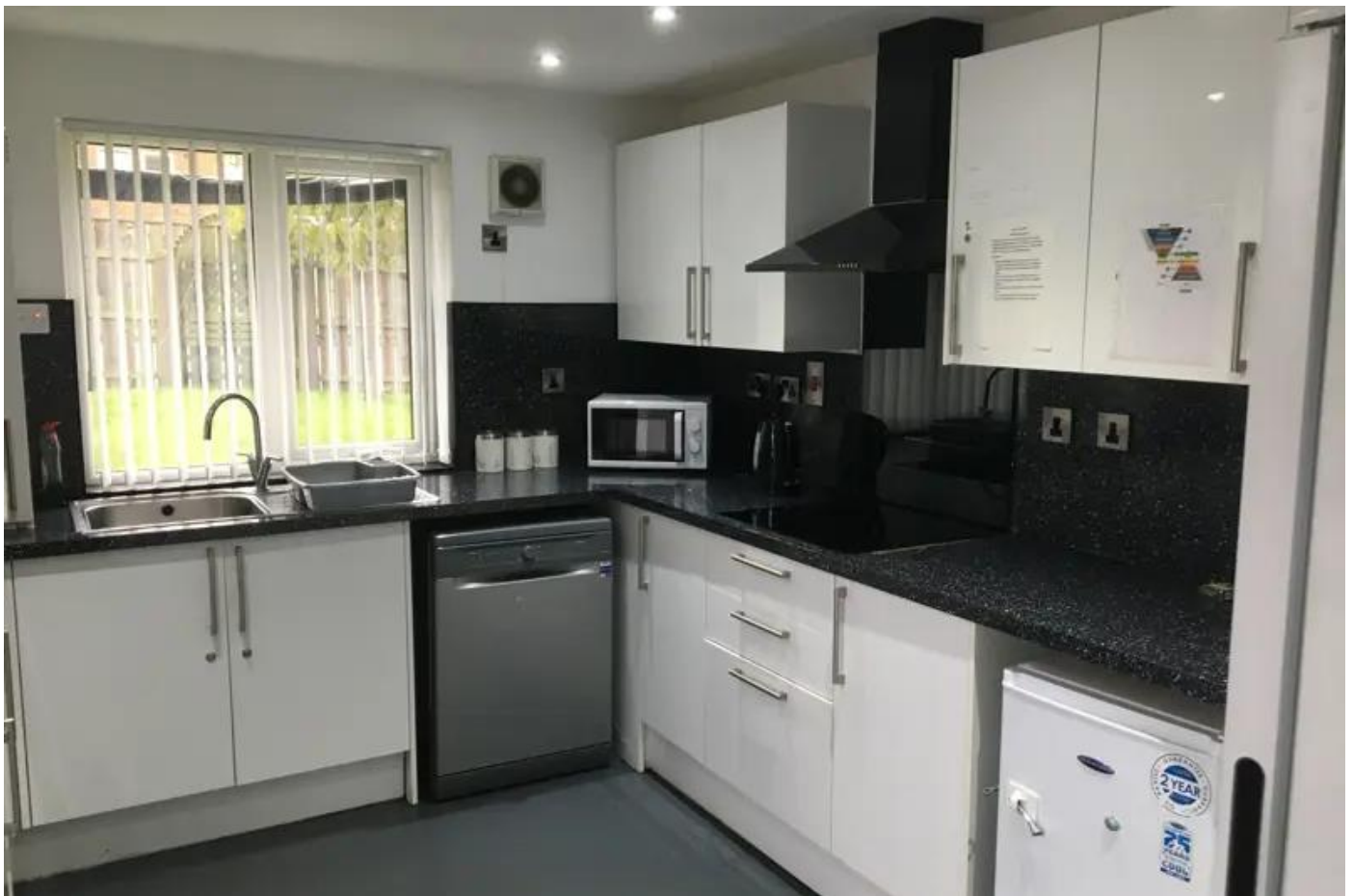
A kitchen at Dean View Villas

There were no responses to a survey for relatives/friends of residents at Dean View Villas.